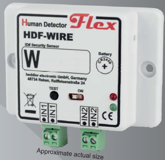
Approximate actual size