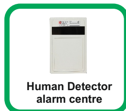
Human Detector alarm centre