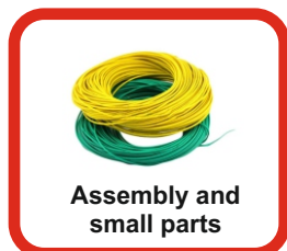
Assembly and small parts