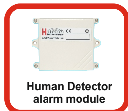
Human Detector alarm module