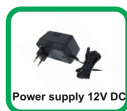
Power supply 12V DC